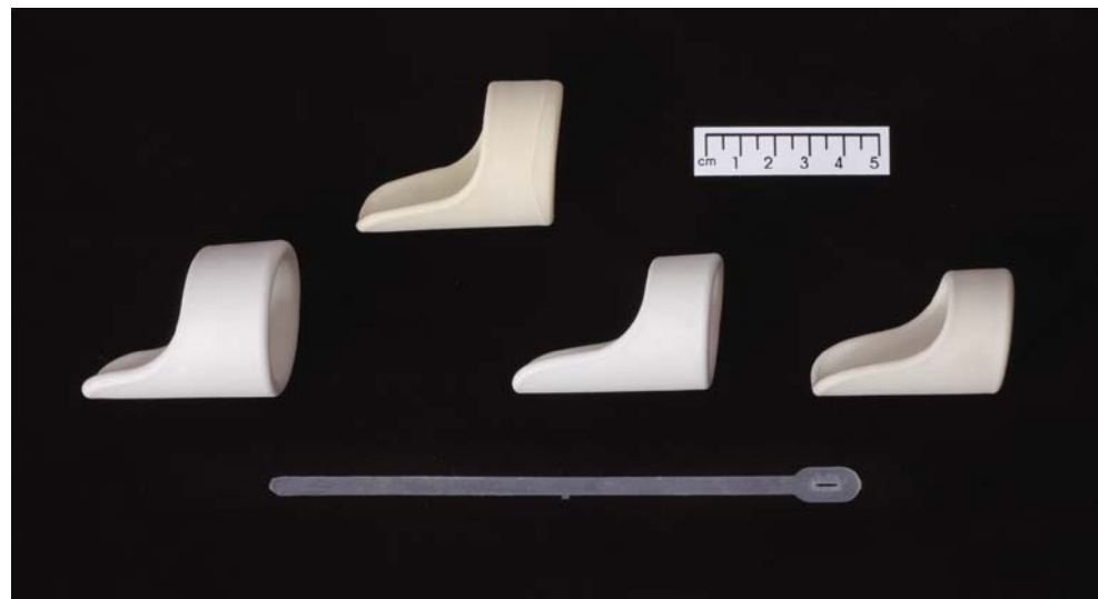
Fig. 1 The Contiform device: large (length of the total shaft, 55 mm×width of the upper surface of the ring, 25 mm×diameter of the ring, 43 mm), medium/large (55×20×39 mm), medium (55×18×37 mm), and small (52×18×35 mm) sizes used in this study with plastic removal strap

the device and ability to speak English and understand written informed consent as per local ethical committee approval. Urodynamic testing was not required as this device was originally designed to be used in the community. Exclusion criteria were: prolapse beyond the introitus, a main complaint of urge leak, bacterial cystitis (symptomatic or proven UTI) at the time of insertion, recent pelvic surgery within the last 3 months, previous pelvic radiotherapy, or pregnancy. Any demonstrable constipation on history or examination was treated before fitting the device.